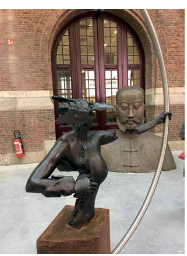
'Amazone en Armes' - Félix Roulin - Artist representing Beligum